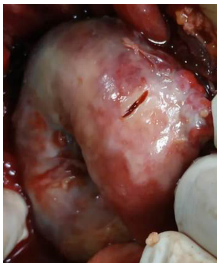
Figure 1 Intraoperative photo showing a marked circumferential thickening of the wall of the sigmoid colon and the rectum.

neoplastic growth infiltrating through the whole wall thickness: mucosa, submucosa and musculosa. The tumor is composed of mucin secreting signet ring cells forming nests and acini and were floating within mucin lakes. The cells showed pleomorphism, hyperchromatism, with marked nuclear atypia. Foci of necrosis were noted as well (Figure 2).