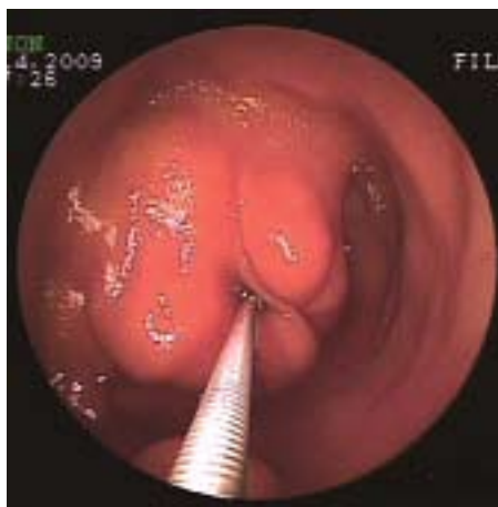
Figure 4 When compressed with biopsy forceps during the double-balloon enteroscopic examination, these submucosal tumors had a soft consistency, with mucosal indentation, the so-called “cushion sign.”

indentation, which constitutes the so-called “cushion sign” (Figure 4). The endoscopic diagnosis was multiple jejunal lipomatosis. Several biopsies of these lesions were taken for pathological diagnosis. The double-balloon enteroscope could be passed through the entire jejunum.