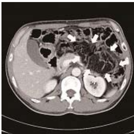
Figure 1 Abdominal computed tomography showed large amounts of fatty infiltration (white arrows) involving the jejunum and mesentery.