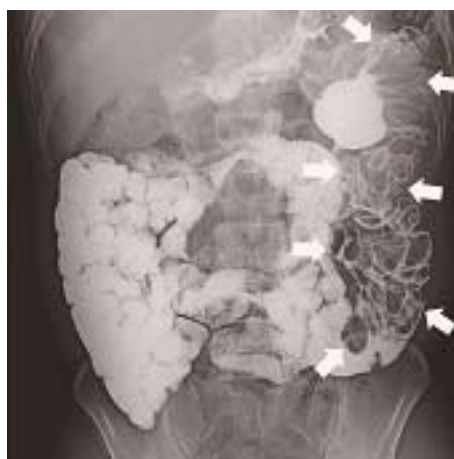
Figure 2 A barium study of the small bowel showed multiple, variably sized, polypoid lesions (white arrows) extending from the proximal jejunum to the distal jejunum.