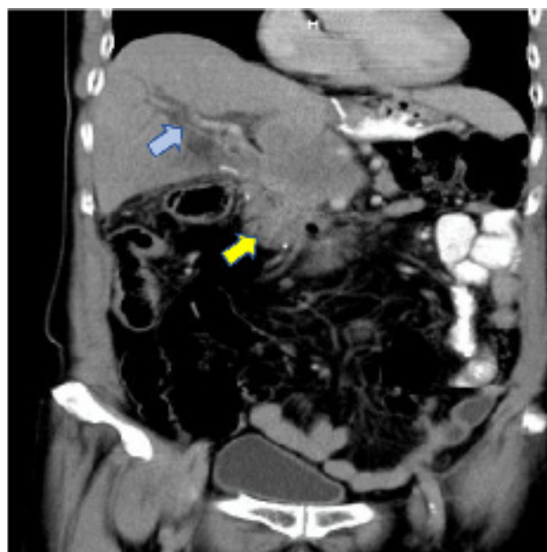
Figure 1 Abdominal CT showed dilated right intrahepatic duct (blue arrow), as well as enlarged lymph nodes (yellow arrow) which obstructed the CBD.

Obstructive jaundice in gastric cancer is a rare complication, with the incidence of jaundice associated with gastric cancer reported to be only 2.3% [5] . In some cases, ERCP may be challenging as sometimes, the endoscope cannot reach the ampulla of Vater due to gastric outlet obstruction by the tumor, or due to surgically altered anatomy [6] , such as Billroth I, Billroth II, and Roux-en-Y [7] . The difficulties to guide the endoscope into the loop is caused by the presence of anastomosis angulations, adhesions, excessive length, Braun entero-entero-anastomosis, and distorted anatomy at the duodeno-jejunal angle [8,9] . Patients with surgically altered anatomy have lower ERCP success rates compared with patients having normal anatomy [10] . Altered anatomy is found in patients with congenital anomalies, duodenal stenosis, large periampullary diverticula, and also diversionary surgery, of which Billroth II partial gastrectomy is the most common [8] . In a study by Cheng et al it was shown that the success rate of ERCP in patients with a prior history of Billroth II