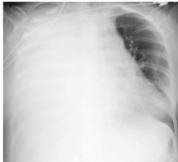
Figure 2 Chest radiography showing a massive right-sided pleural effusion.

A pleuroperitoneal shunt is a silicone medical device consisting of a pump chamber, which can be manually compressed, and 2 catheters; the device transfers fluid from the pleural cavity to the peritoneal cavity. The pump is able to overcome the pressure gradient between