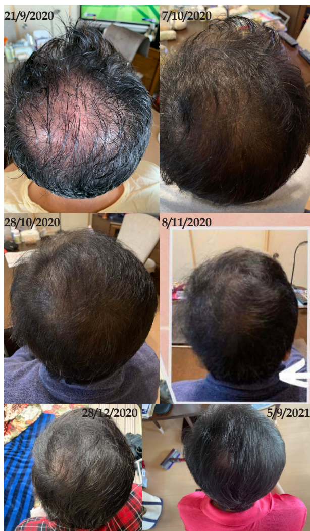
Figure 3-8 The hair growth of the patient with hypertension started on September 21, 2020 and completed on September 5, 2021 with aloe vera juice ingestion.