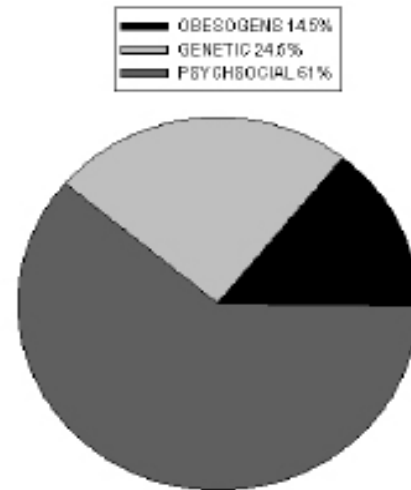
Figure 1 Percentages of individuals with obesity sub-types as defined by exposure to Early Life Obesogens, Genetic Risk, and Psycho-Social Factors.

after VSG at their 6 month postoperative visits. We believe that this is a major finding because a previous study of patients who underwent VSG revealed that > 90% of the patients' percent excess body weight loss occurred by their 6 month follow up visits (Mean+/-SD: 39%+/-2) compared to their 24 months postoperative visits (Mean +/- SD: 42%+/-4) [10] . In our search of the medical literature, no other publication has yet explored the influence of early life obesogens on outcomes after bariatric surgery.