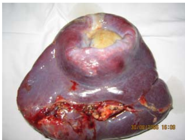
Figure 3 Abscess of spleen (total splenectomy).

The primary site of infection was found in 3 cases, (endocarditis and urinary infection). There was one case of epithelial cyst of the spleen that was secondarily infected and in the other 7 cases the abscess; it was about primary spleen damage.