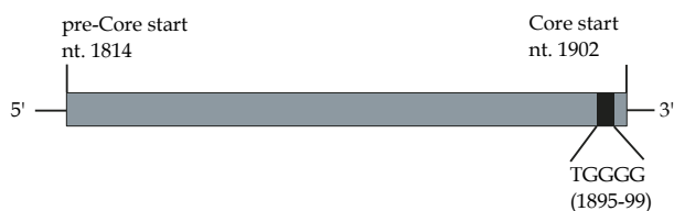
Figure 1 Schematic representation of HBV pre-Core (pre-C) gene. Location of the 5'GGGG tetrad stretch is shown.

mutations in the pre-C coding sequences in HBeAg negative HBV isolates.