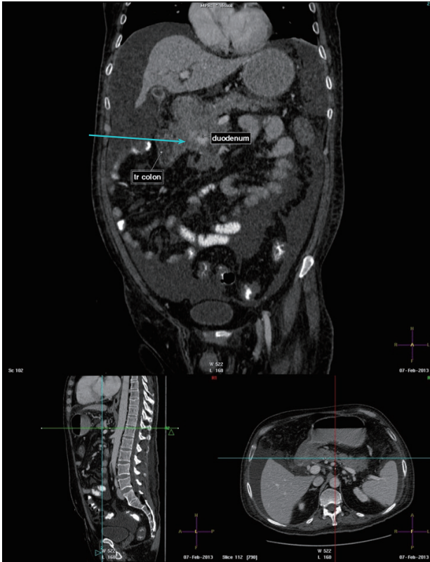
Figure 1 Abdominal CT scan; Mass encasing second and third parts of the duodenum adherent to the transverse colon, pylorus of the stomach, head of the pancreas and short segment of the jejunum.